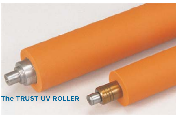
The TRUST UV ROLLER

The newest UV roller technology is now available in North America